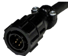
8-pin Amp® connector