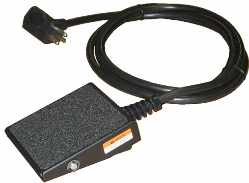
(cable with 3-pronged series connector shown)

Dimensions, L x W x H: 4.3" x 3.5" x 1.4" Weight (S400-1001): 1.4 pounds IEC enclosure rating: IP-21 Finish: powder paint, black