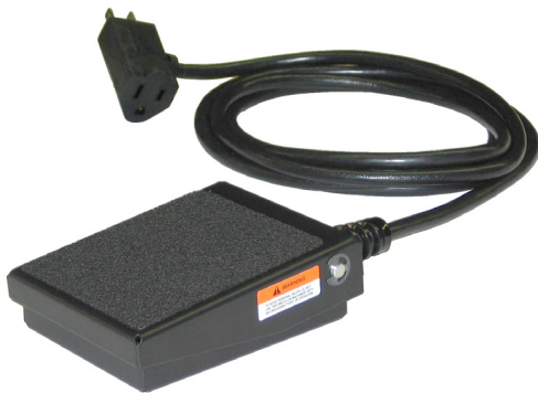
(cable with 3-pronged series connector shown)

Dimensions, L x W x H: 4.3" x 3.5" x 1.4"