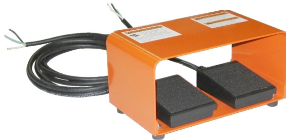
Dual-Unit Guard (S100-1502DG shown)

Dimensions, L x W x H: 10.3" x 6.0" x 5.6"